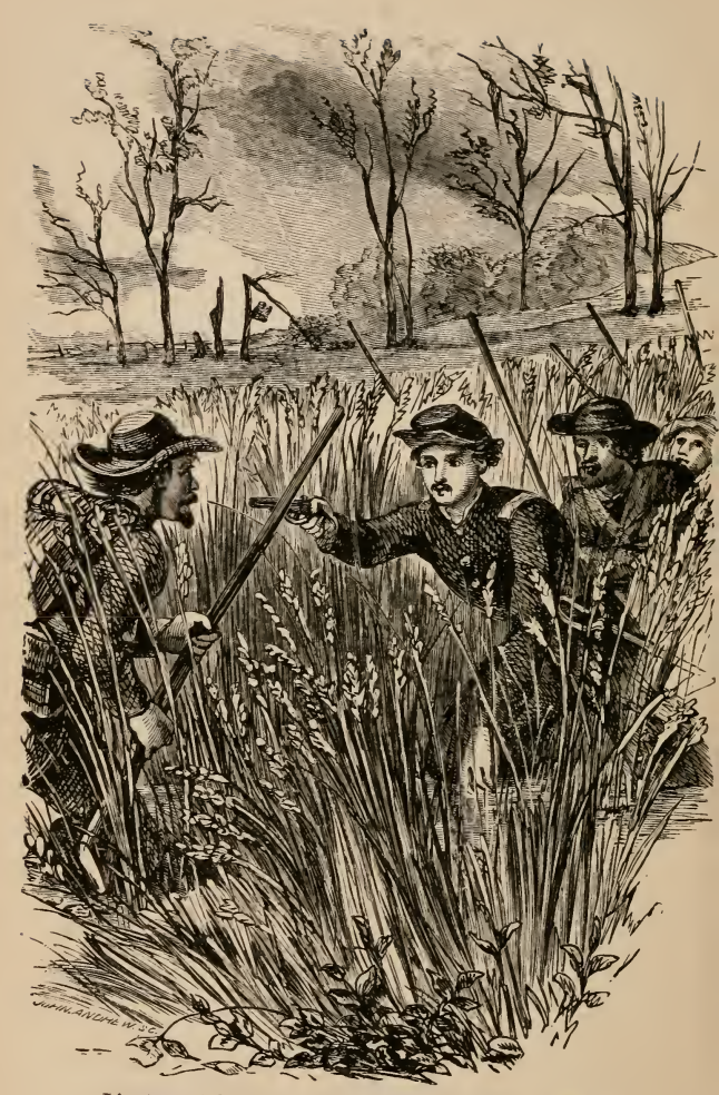
Lieutenant Somers and the Rebel Pickets. Page 70.